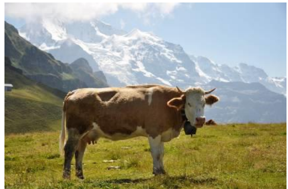
Swiss cow with cowbell

The tribes of Ruben and Gad had much cattle and wanted to stay therefore in mountainous Gilead with its woods and meadows. Gad, Ruben and half of Manasseh ended up on the high plains of Jordan.