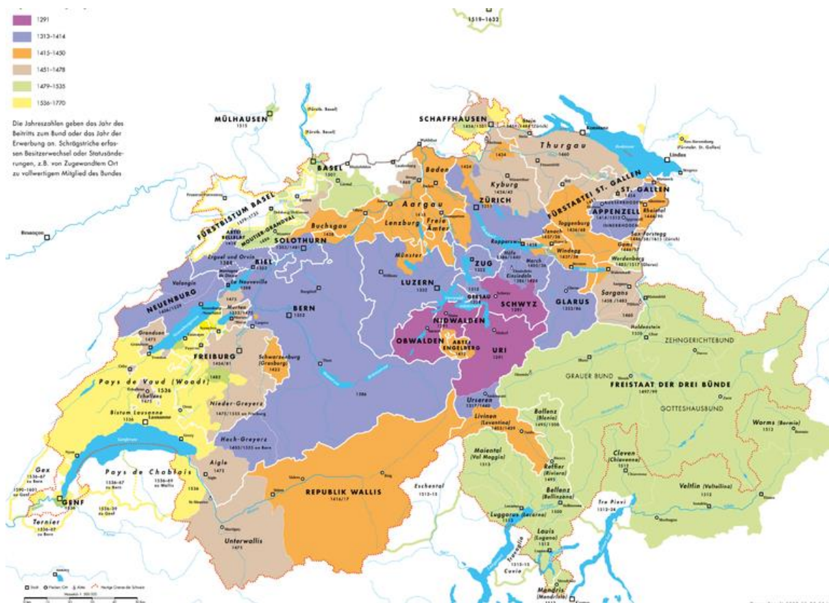
Development of the Swiss Eidgenossenschaft

September 2016, Gouda, Holland, Bert Otten