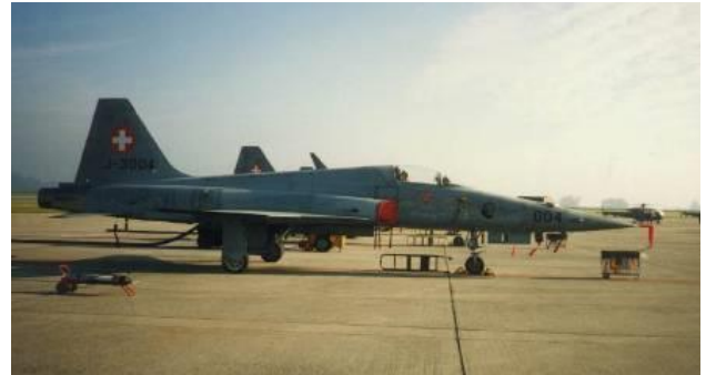
Parked F-5E's (Aug. 2007)

Switzerland has one of the biggest and most expensive armies of Europe. Per capita Switzerland has the biggest army in the world, after the State of Israel.