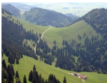
Hills in the Jura

Switzerland is well known for its mountains. The Alps in the south and southeast (highest point, Monte Rosa, 4634m) and the Jura mountains in the west (highest point, Mont Tendre, 1678m).