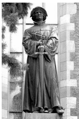
Zwingli with sword and Bible

Zwingli was a proponent of armed struggle against the catholic cantons. He died in a battle against the catholics. His helmet has been taken as a trophy to Lucerne and can be seen in a museum there, together with his sword and battle-axe. Zwingli was a reformer – think of Elijah – and attacked his 'false-prophets' with both the Bible and the sword.