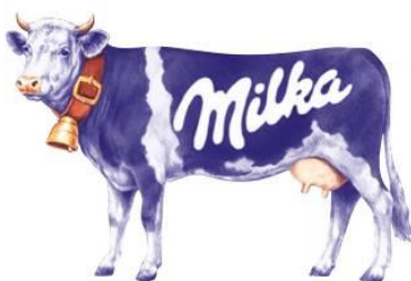
Cattle – milk – chocolate – happiness ...

Wikipedia: The 17th century saw the start of chocolate processed in Switzerland ... In the second half of the 19th century Swiss Chocolate started to spread abroad. Closely linked to this was the invention of Milk Chocolate by Daniel Peter in Vevey and the invention of the conching by Rodolphe Lindt ... From the 19th century until the First World War and throughout the Second World War the Swiss chocolate industry was very export-oriented ... Today most Swiss chocolate is consumed by the Swiss themselves (54% in 2000), and Switzerland has the highest per capita rate of chocolate consumption worldwide (11.6 kg (25.6 lbs.) per capita per annum). In 2004 148,270 tonnes of chocolate were produced in Switzerland. 53% of this was exported.