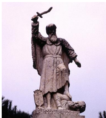
Elijah with sword on mount Carmel

Cherith. Elijah was a prophet, a reformer, in the northern kingdom, in the House of Israel. It is noteworthy that he is the only prophet of whom we know that he had killed hundreds of false prophets by the sword. Preaching the Word of the LORD and handling the sword were both practiced by him. Elijah is the best-known Gadite of the Old Testament.