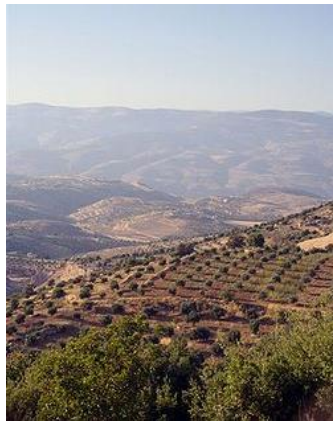
The mountains of Gil'ad, presentday Jal'ad, Jordan

There is an ante-typical fulfilment of that flight to the mountains of Gilead. At the beginning of the Jewish Revolt (66-70) the Messianic Community of Jerusalem fled to Pella (in Gilead), according to the historian Eusebius of Caesarea.