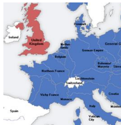
Switzerland and the Axis Powers

When called upon, the Gadites of Jabesh in Gad (Gilead) did not send men either, to avenge the corruption of the Benjaminites of Gibeah.